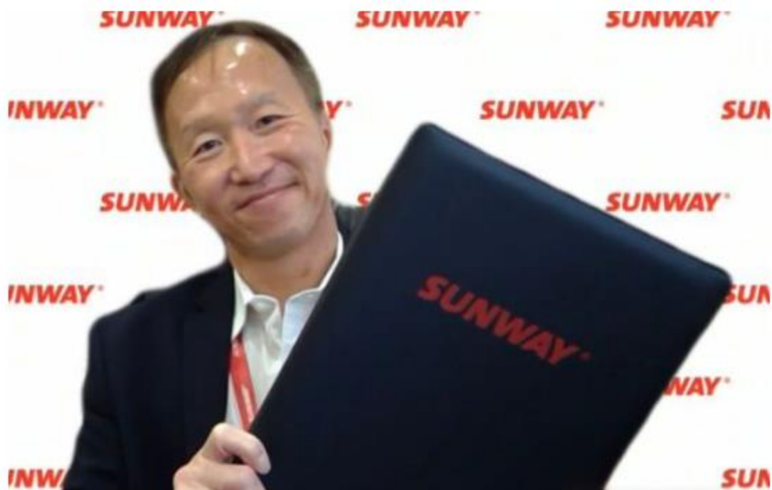
Sunway Construction Liew Kok Wing